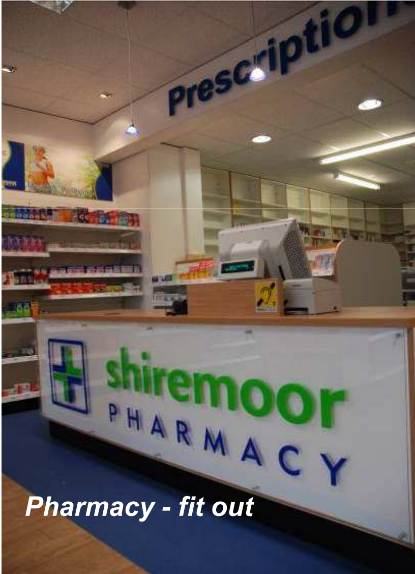
Pharmacy - fit out