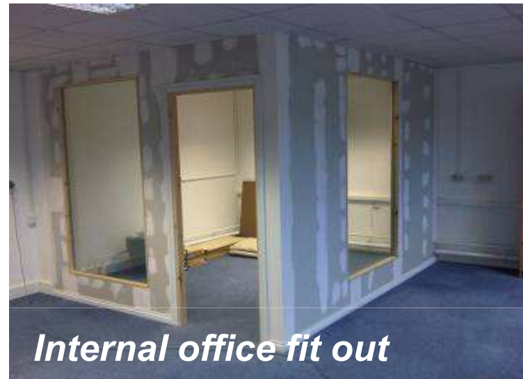
Internal office fit out