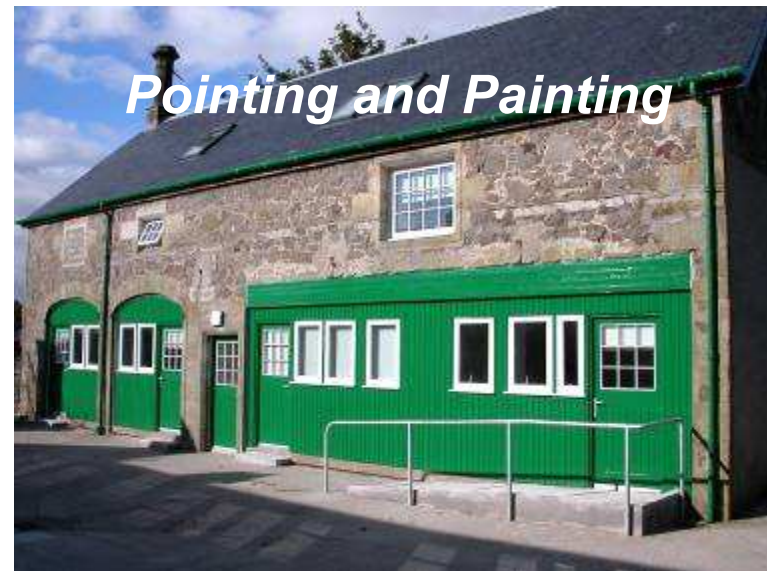
Pointing and Painting